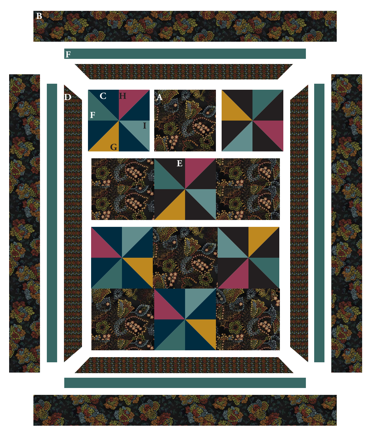
Quilt Assembly Diagram